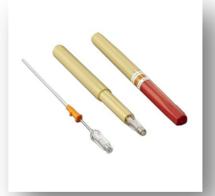
1 pcs Chest Decompression Needle 14 G