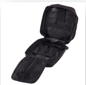
1 pcs Medical Bag