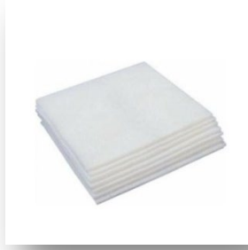
1 pcs Combat Gauze