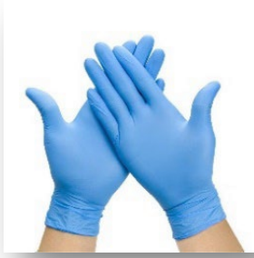
1 pair Nitrile Gloves