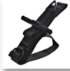
1 pcs Extremity Tourniquet