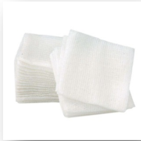
1 pcs Compress Sponge 5x5 cm