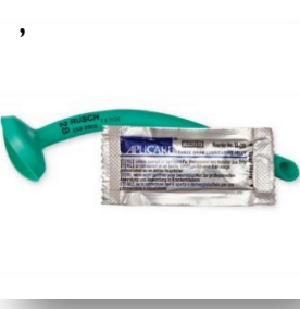
1 pcs Nasal Airway 28 FR