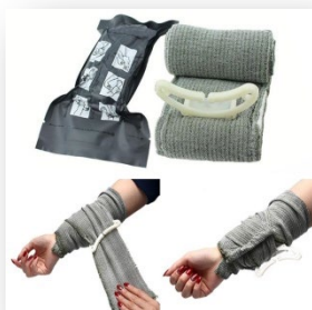
1 pcs Israeli Bandage