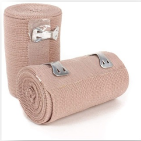
1 pcs Elastic Bandage 10x150 cm