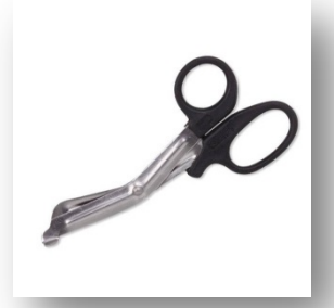
1 pcs Trauma Shears