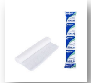
1 pcs Hydrophilic Gauze 30x80 cm