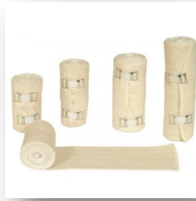
1 pcs 4 in Extremity Bandage